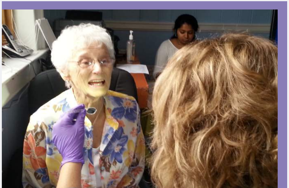
Senior Oral Health Survey, Berlin, NH 2015

Activities and environmental drivers that will support the adoption and implementation of the OHC Plan include: the availability of new data as a result of the addition of an oral health measure to the Uniform Data System (UDS), increased support for medical providers to receive