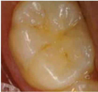
Figure 1. Tooth surface with an early (non-cavitated) carious lesion that exhibits a white demineralization line around the margin of the pit and fissure and/or a light brown discoloration within the confines of the pit-and-fissure area.