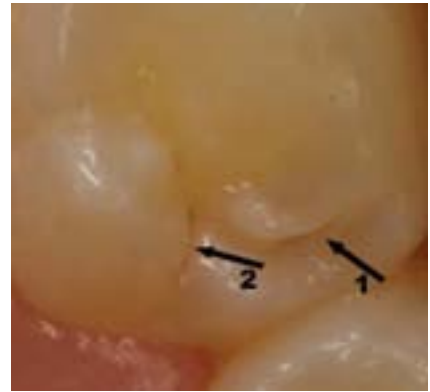
Figure 3. A deep fissure area (arrow 1) and another area exhibiting a small light brown pit and fissure (arrow 2). Note that the lesion does not extend beyond the confines of the pit and fissure.