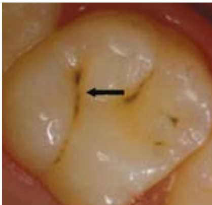
Figure 4. A more distinct early (noncavitated) carious lesion (arrow) that is larger than the normal anatomical size of the fissure area.